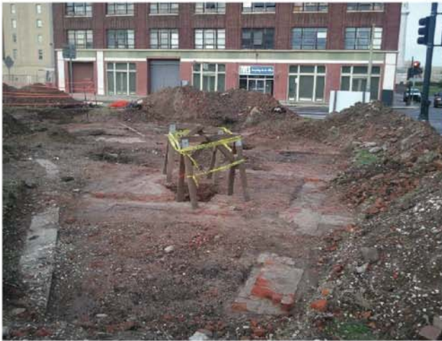
Above: Excavations at the World War II Museum earlier this year revealed brickwork from the Delord-Sarpy House, built around 1815 in a colonial style and demolished in 1957. Right: Plan de la Nouvelle Orleans telle qu'elle estoit au mois de decembre 1731 , by Gonichon, depicts the ditches and wooden bridges that scored early colonial-era New Orleans streets.