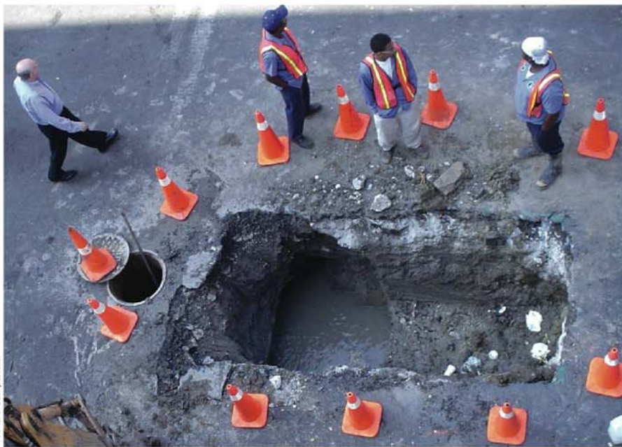
Utility cuts in the French Quarter may be a source of frustration to motorists, but they provide visual insights into hundreds of years of municipal history and physical geography. This ditch was excavated at the corner of Royal and St. Peter in 2003.

Spanish administrators inherited New Orleans' street problems from the French, and drainage remained at the top of the list. Records of the Spanish Cabildo (City Hall) in the 1780s-1790s are replete with discussions of puentes (“bridges”), wooden paving planks built across cross-street drainage ditches to give drayage and pedestrians dry passage “thus avoiding the odor of corrupted and stagnant waters.” Authorities mandated that property owners were responsible for constructing puentes in front of their properties, but widespread noncompliance forced the Cabildo to let the work to city contractors (publicans) funded by property owners, a tax levied on cart proprietors or by the Cabildo itself. A typical New Orleans street in this era constituted packed earth paralleled by ditches and banquettes and lined with rustic cottages. On it were pedestrians, frolicking children, stray dogs, occasional livestock, the Cabildo-paid town crier, and peddlers offering, in sing-song French Creole, everything from “fresh beef,