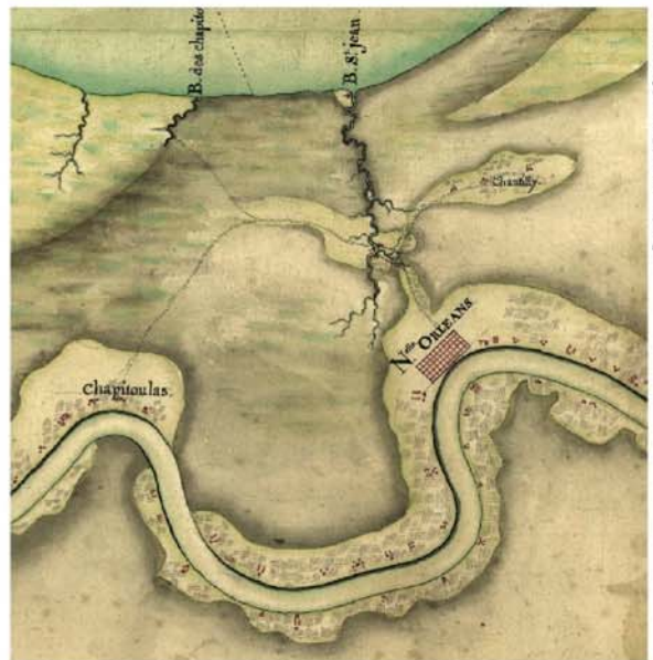
Saucier's Carte particulière du cours du fleuve St. Louis , made around 1750, depicts relationships among topography, hydrology, soils, drainage patterns, and the street grid of colonial-era New Orleans.

A small and largely improvisational French colonial government meant oftentimes residents were tasked with helping develop or maintain urban infrastructure. Officials in the 1730s, for example, mandated that proprietors dig drainage ditches five pieds from their lots, to dry out a corridor as a primitive sidewalk. Few complied and even fewer mastered local hydrology, and ended up creating back-upped and overflowing pools. Intersections were particularly problematic in