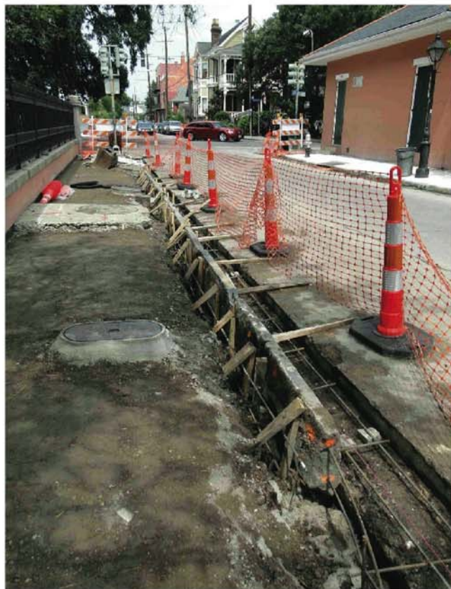
New sidewalks installed along Royal and Esplanade in August 2012. Note the reutilization of old granite paving blocks to form the curb.