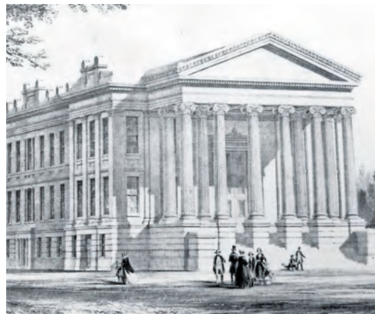
Municipal Hall, designed in 1845 by James Gallier for the First Municipality, later became City Hall.

The three municipalities were then sectioned into wards, each of which elected a number of aldermen based on their population size.