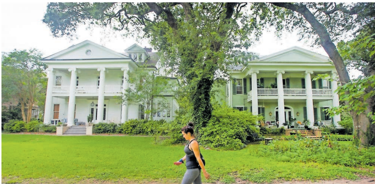
Greek Revival formed the first major American architectural contribution to the New Orleans cityscape.