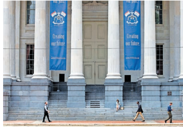
James Gallier designed Municipality Hall (known today as Gallier Hall) and built it of white marble from quarries in New York.