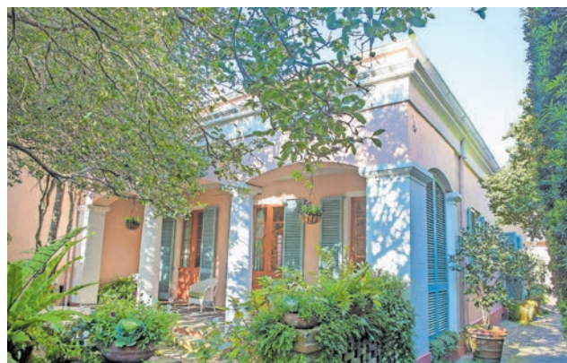
The earliest known surviving structure in New Orleans with prominent Greek traits is the Thierry House (1814) at 721 Gov. Nicholls St.

Greek Revival began to fall out of fashion as the agrarian