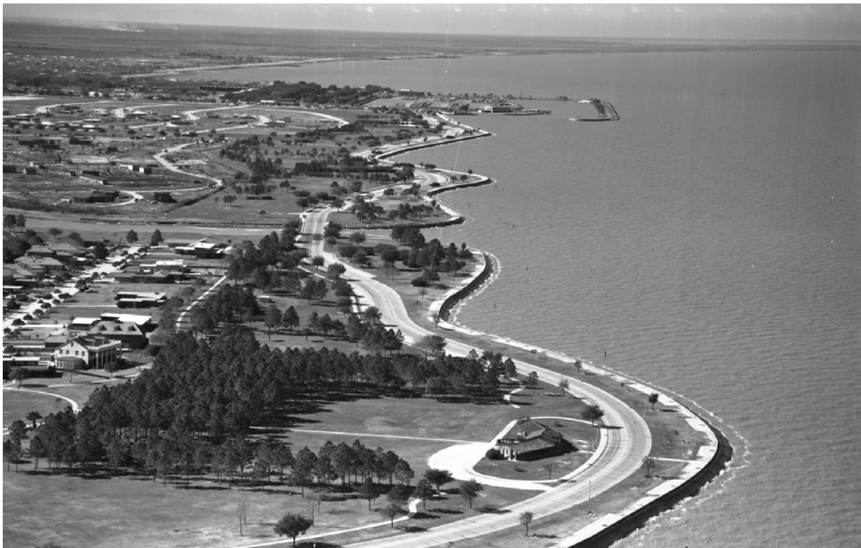
Lakefront neighborhoods looking west, c.1950.

So promethean was the project that a municipal airport was added to the scheme “almost as an afterthought,” wrote geographer Peirce F. Lewis. It was an ideal site for an airport, requiring no real estate purchase, imposing no interference with existing urban infrastructure, providing obstruction-free approaches and departures, and allowing for expansion farther into the lake.