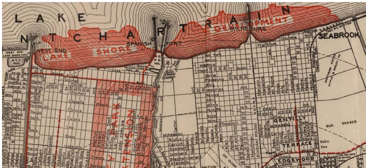
Detail of 1925 Map of the City of New Orleans and Vicinity showing upcoming Lakefront project.

Published in the New Orleans Times-Picayune , April 13, 2018