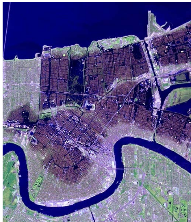
Satellite image from Sept 2, 2005, showing how the Lakefront became an island.

Consider the irony: a space that had once been water became, for a few weeks in 2005, a manmade island, while a vast expanse of natural land, sunken unnaturally, filled with water.