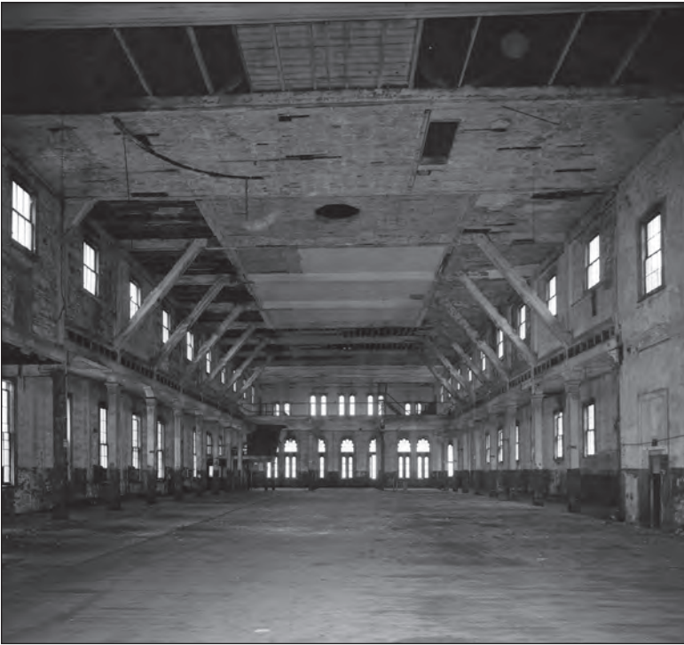
ABOVE: The interior of Exposition Hall, later known as Washington Artillery Armory. RIGHT: The building's exterior. It was located at 740 St. Charles Ave.