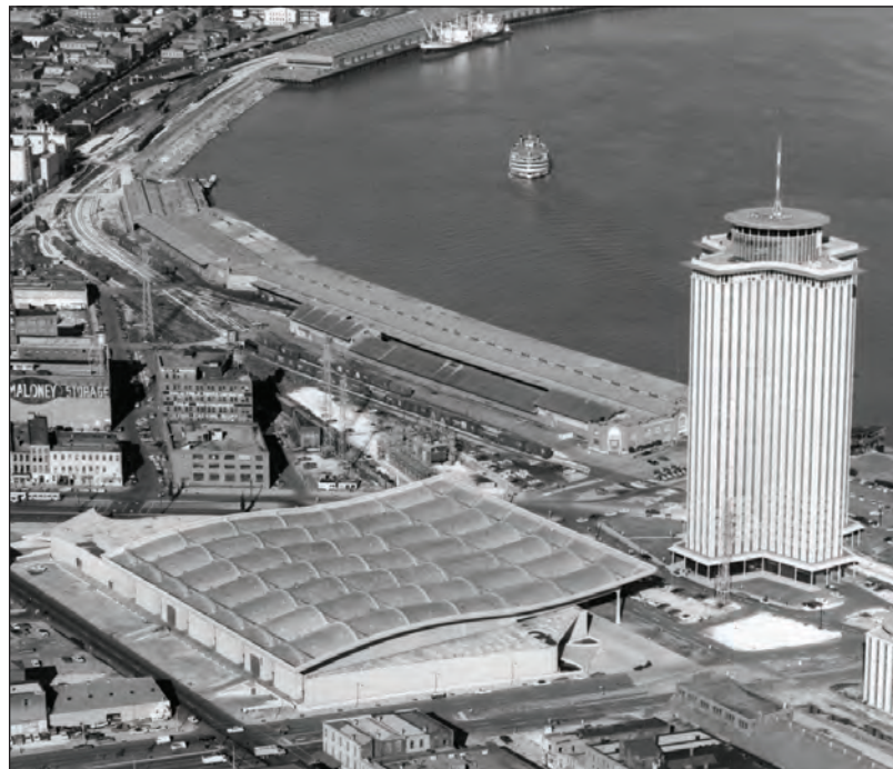
A view of downtown New Orleans' riverfront in 1970 with Rivergate visible in front of the World Trade Center building.

What ensued in the early 1990s was a complex caper involving chicanery on the part of promoters and politicians and a gross overestimate of just how successful a downtown casino might be. What got sacrificed was the Rivergate Exhibition Hall, whose prime location and ample footprint had the casino people salivating. The architecture community spoke passionately of the building's remarkable design and argued for adaptive reuse, but they failed to inspire many rank-and-file preservationists, not to mention government and business interests. Sadly, the battle to save the Rivergate marked the last chapter in the six-decade career of the