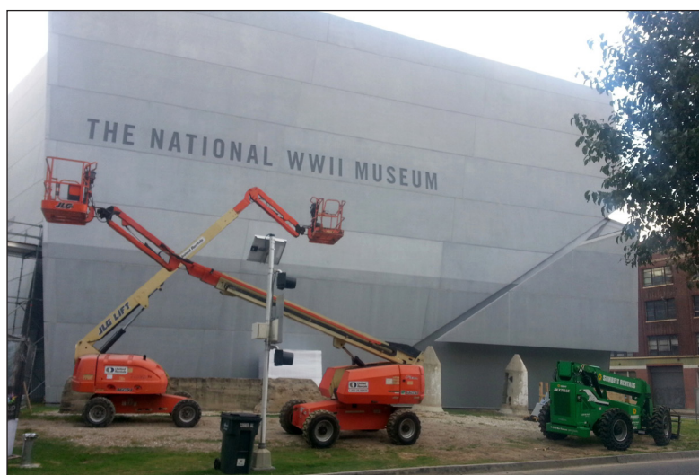
TOP: The Delord-Sarpy foundation, excavated in February 2012. Photo by Richard Campanella. ABOVE: The site of the former Delord-Sarpy House as it looks in 2015. Photo by Richard Campanella