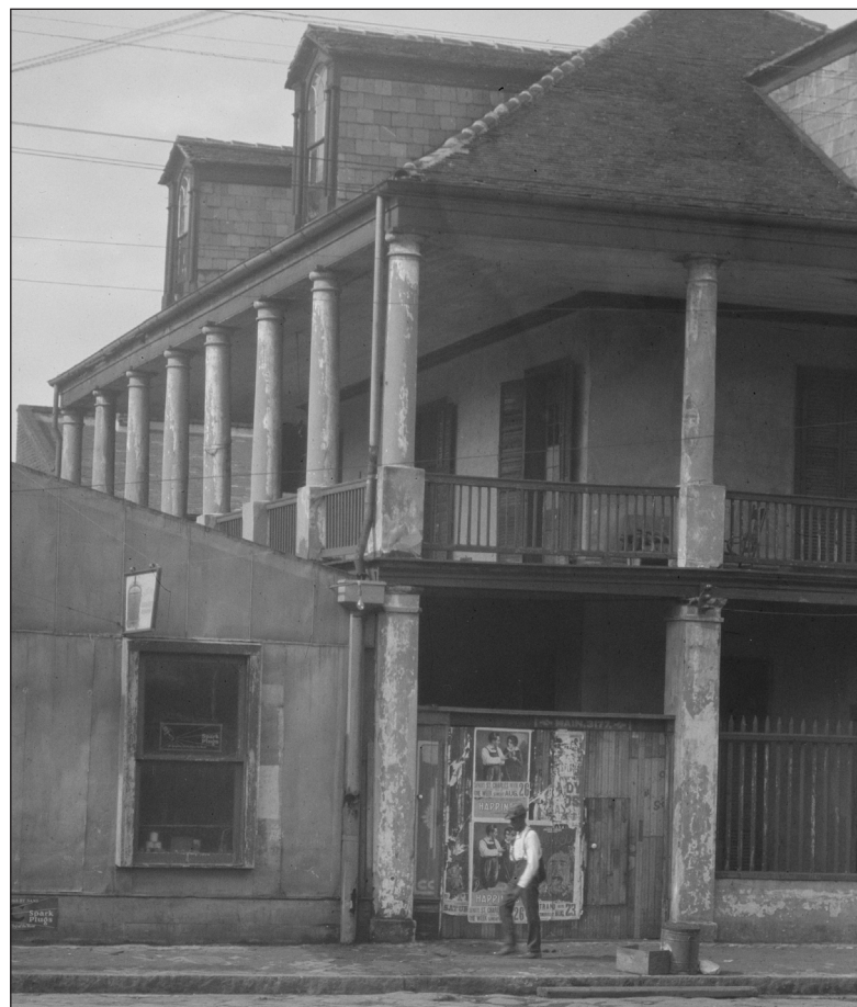
ABOVE: Delord-Sarpy House in 1928 by Arnold Genthe. Courtesy Library of Congress BELOW (LEFT TO RIGHT): Two photographs of the Delord-Sarpy House taken by Richard Koch as part of the Historic American Building Survey in 1936; The Delord-Sarpy House in 1930s, photographer unknown. Courtesy State Library of Louisiana

True to the West Indian-influenced design philosophies of local French Creole builders, Montegut's house had no hallways, an exterior staircase,