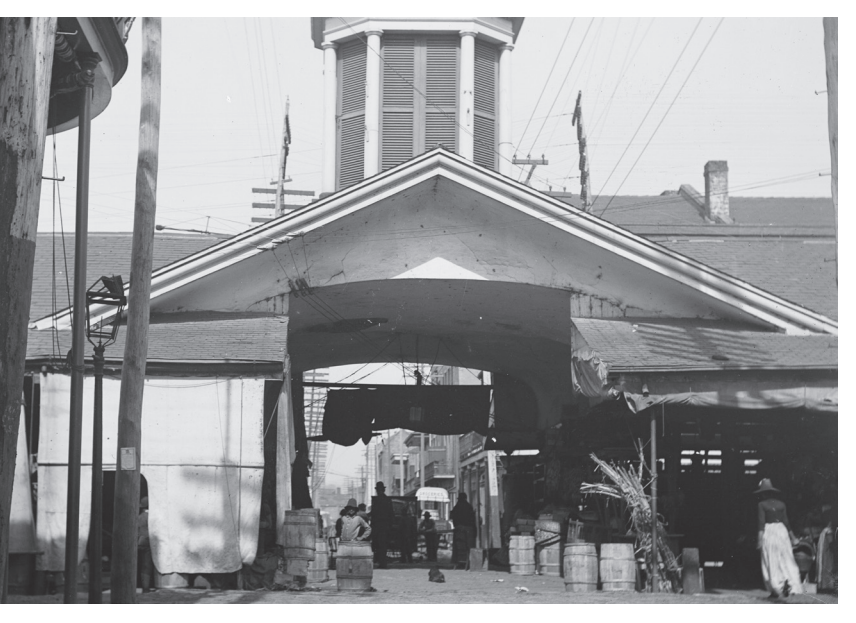
ABOVE: A view under the cupola of the Poydras Market taken by famed Western photographer William Henry Jackson in the 1890s, courtesy Library of Congress. TOP AND BOTTOM RIGHT: Poydras Market in the 1920s, courtesy Library of Congress.