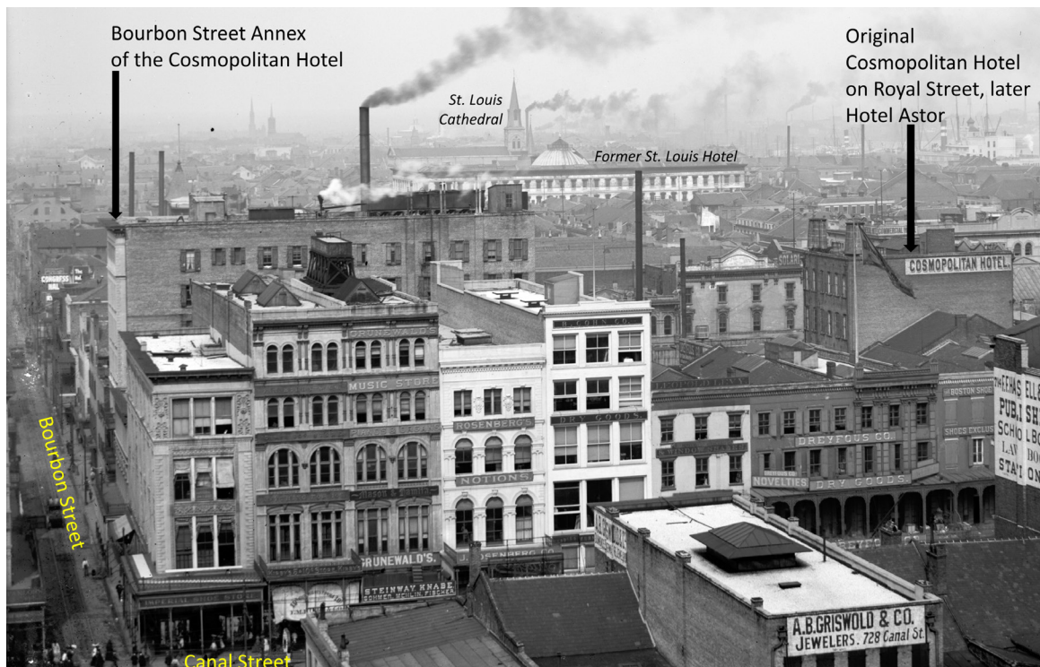
ABOVE: View of Cosmopolitan Hotel complex from the Maritime Building, 1905. Courtesy Library of Congress, annotated by the author

The Cosmopolitan's success ushered in a new era of handsome high-rise hotels