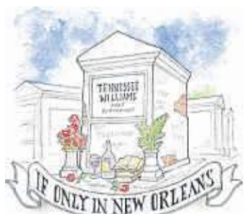
ILLUSTRATION BY ARTHUR NEAD